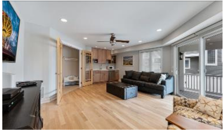
Another view of the first floor family room with wet bar and access to front deck