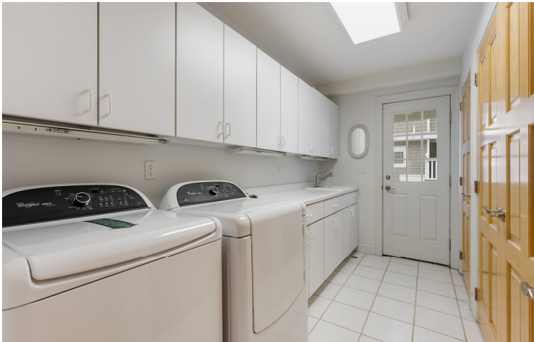
First floor utility room with washer, dryer, sink, plenty of cabinets, and counterspace