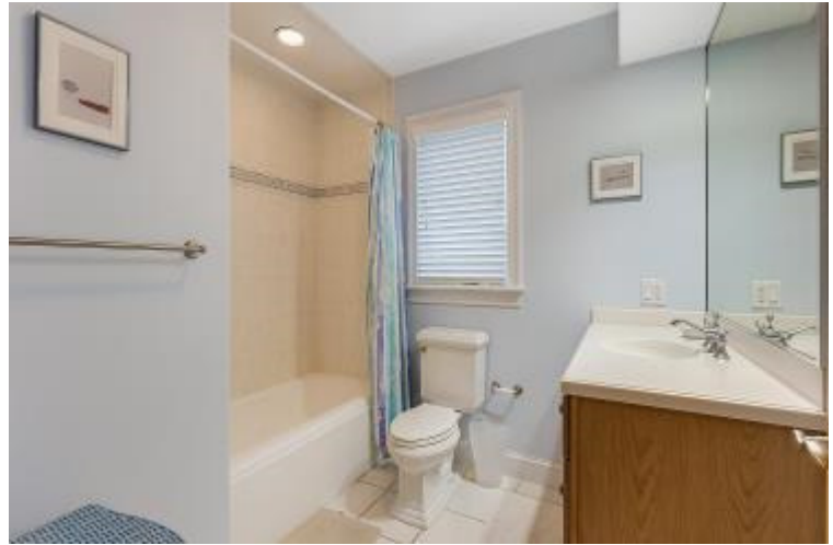
First floor bathroom with tub, tile floor, and recessed lighting

Ceiling Fans & Recessed Lighting Throughout Home