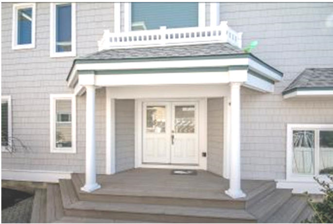
Entrance to home with paver walkway