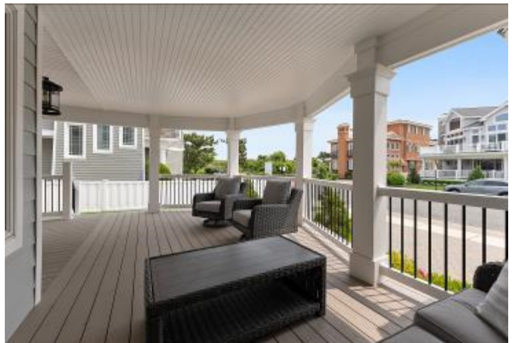
First Floor Front Deck