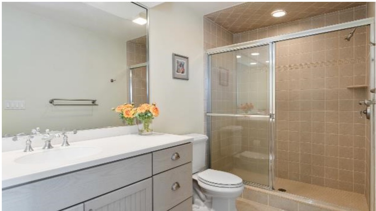
Second Floor Bathroom with Walk-In Shower and Tile Flooring