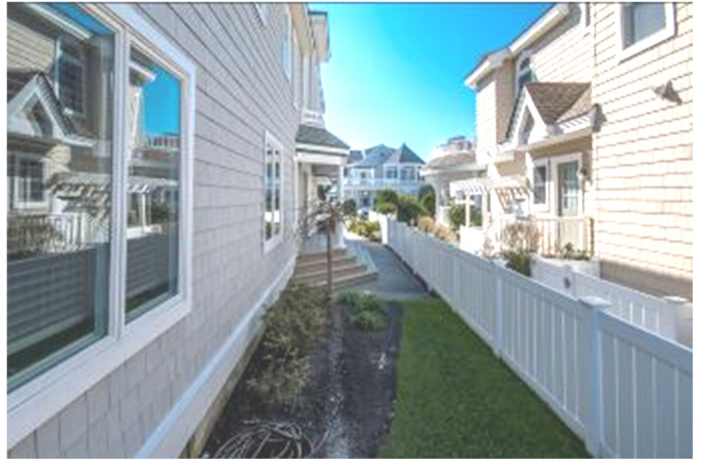
Nicely landscaped with grass yard