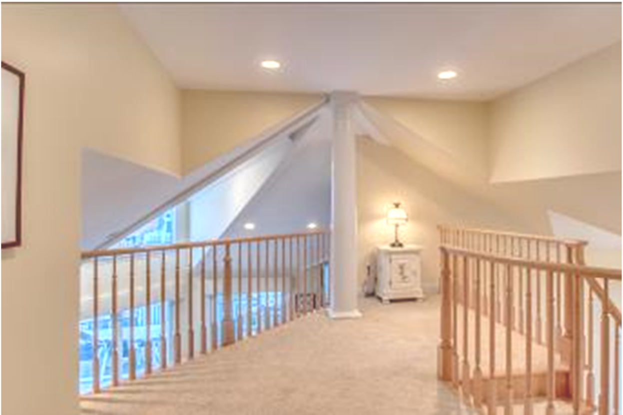
Third floor landing area to Master Bedroom Suite

Open Area Off Stairwell from 1st to 3rd Floors