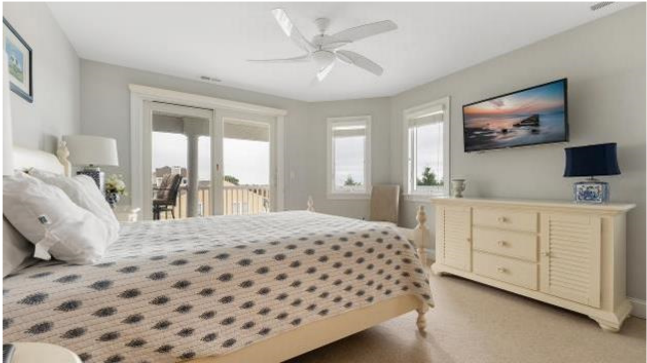
Second Floor East Bedroom with Wall-to-Wall Carpeting, Ceiling Fan, and Access to Rear Deck with Great Views