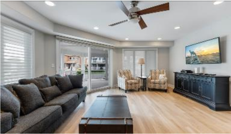
Spacious first floor family room with hardwood flooring, ceiling fan, recessed lighting, and access to front deck